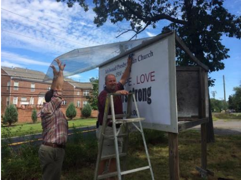
I am honored to be in our congregation.

This picture is just one example of all the things our congregations does to keep our church moving forward.