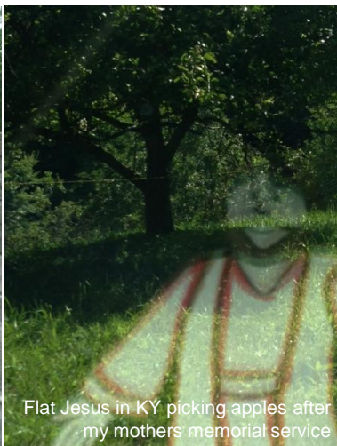
Flat Jesus in KY picking apples after my mothers memorial service