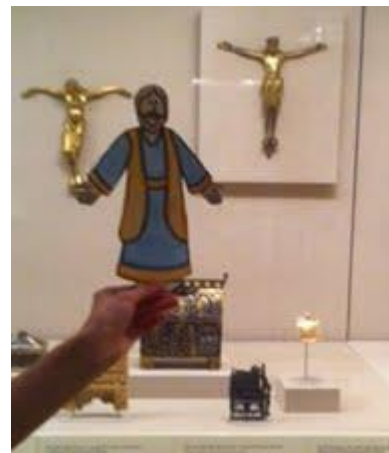
Flat Jesus at Metropolitan Museum of Art in New York